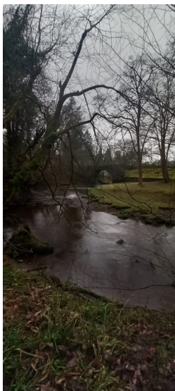
Some nice photos of landscapes from James Hiller in Year 10