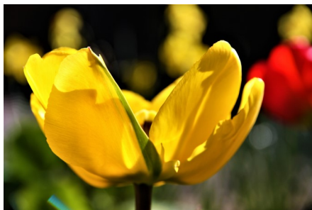
Some wonderful photos from Barny Buston in Year 10