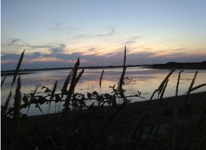
Submitted by: James Hiller

Entries to our spring photography competition